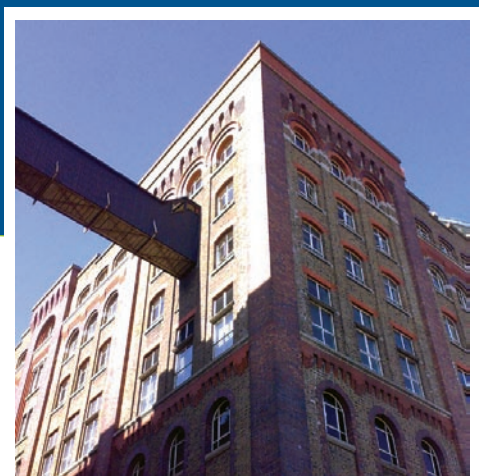
Guinness Storehouse Dublin's number one visitor attraction