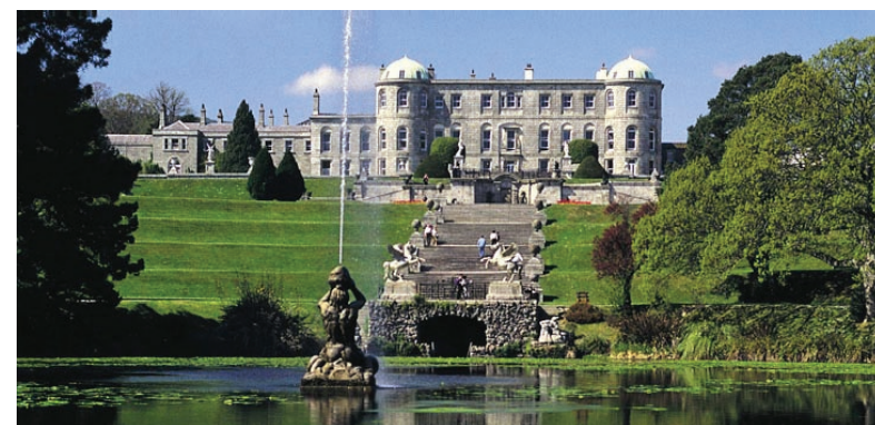
Powerscourt House and Gardens Set in County Wicklow, the 'Garden of Ireland'