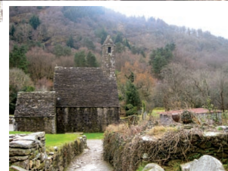
Glendalough Historic, monastic site